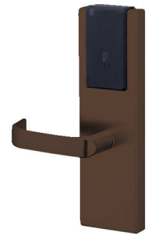
Mid Bronze Finish (CB)