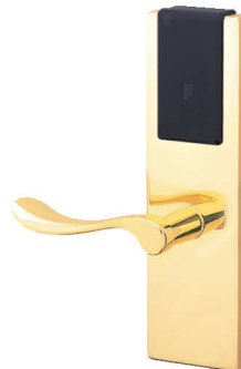
Polished Brass Finish (YB)