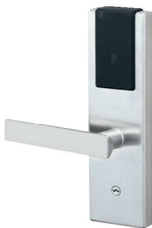
Satin Stainless Steel Finish (ST) Key Override available as an option.