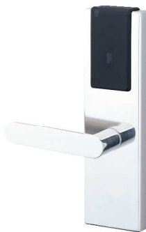
Polished Stainless Steel Finish (SB)