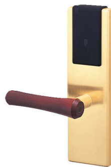
Satin Brass Finish (BS)