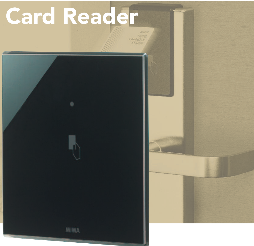
Elevator card reader RDFL-B03H